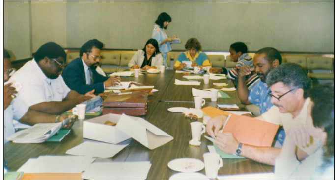
Leaders at Orientation for the RDLN Rural Development Institute at the University of California at Davis

The Program - Duration: 18-36 months. Demanding curriculum includes: Field Project implementation, related independent study, RDLN Rural Development Institute (4 1/2 weeks) for intensive study, exchange and networking. Qualified participants may earn a certificate or master's degree. (We are willing to work with schools for bachelor's or PhD also.) Each RDLN Leader works with the guidance of a Field Advisor and Study Advisors. Each has a Sponsoring Organization, which serves as an umbrella for the Field Project and contributes financially to RDLN. The amount required is $7,500 (certificate)-$25,000 (M.A. option).